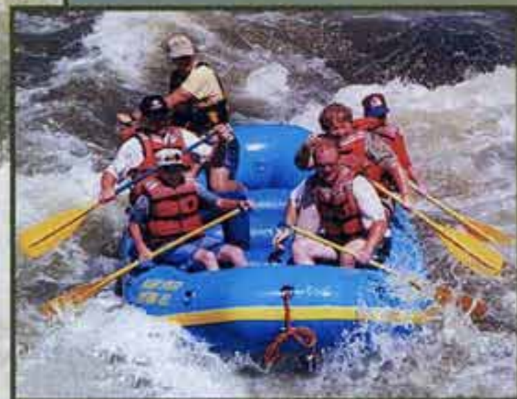
...and the young at heart.