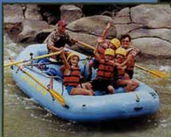
Fun for the young...