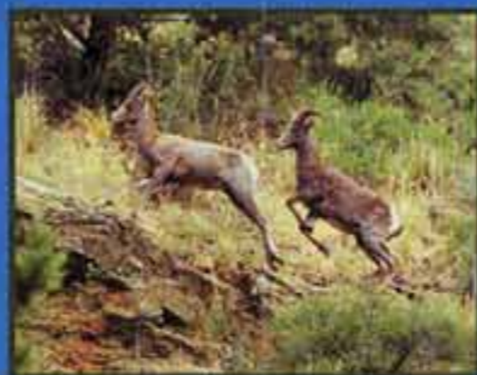
Enjoy the wildlife